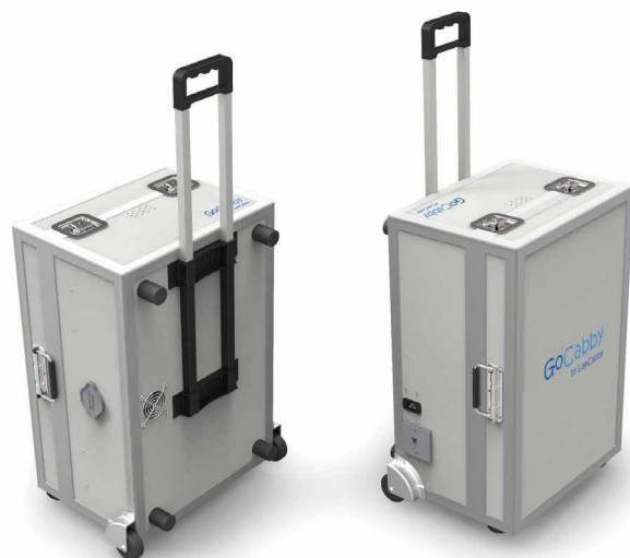
Front and Back of GoCabby

Store with or without protective cases including GRIPCASE